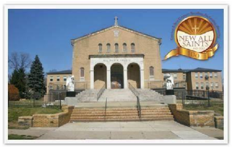
Recalling, Reclaiming, Renewing